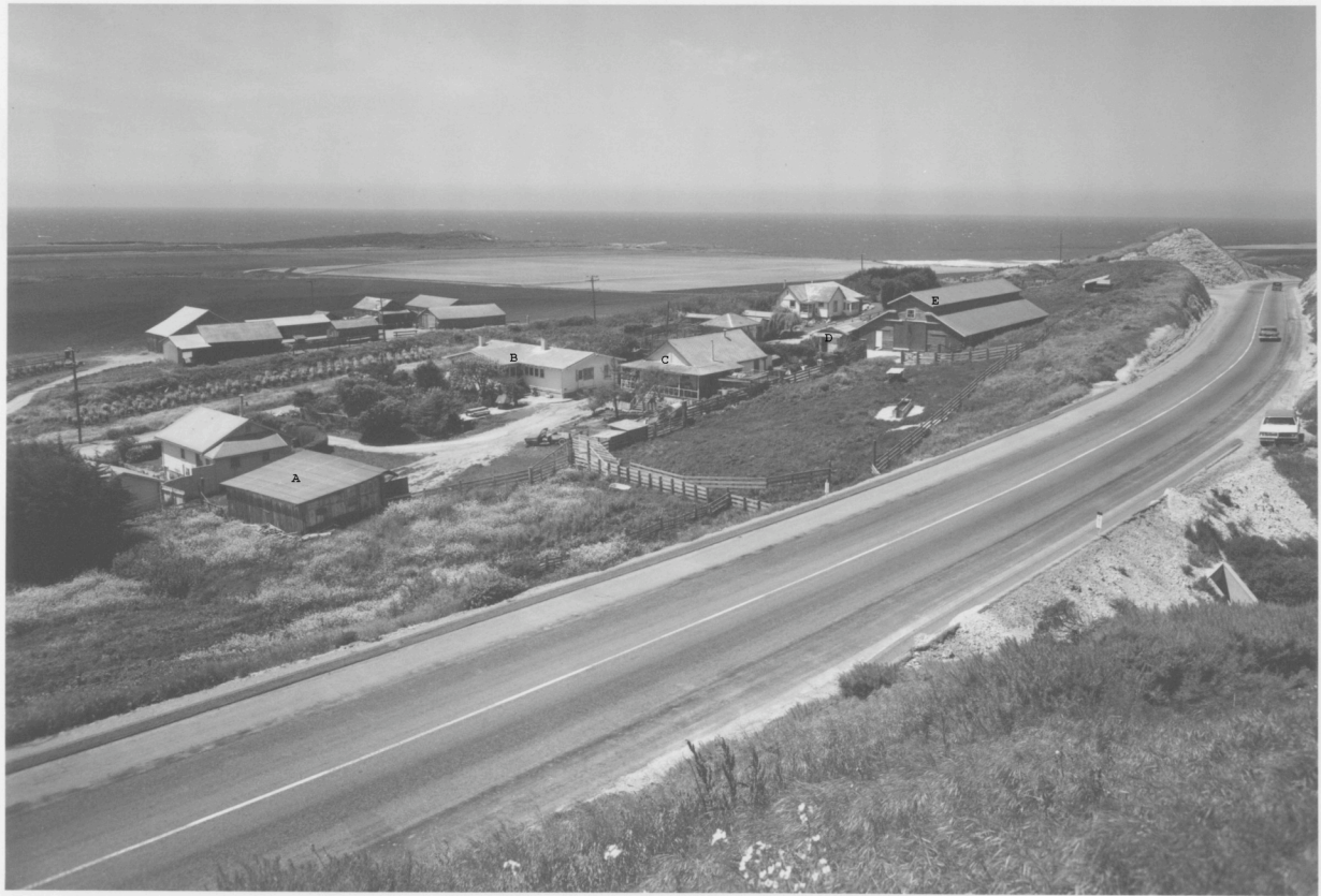
The Thomas Majors Ranch On Highway 1 (5500 coast Road)