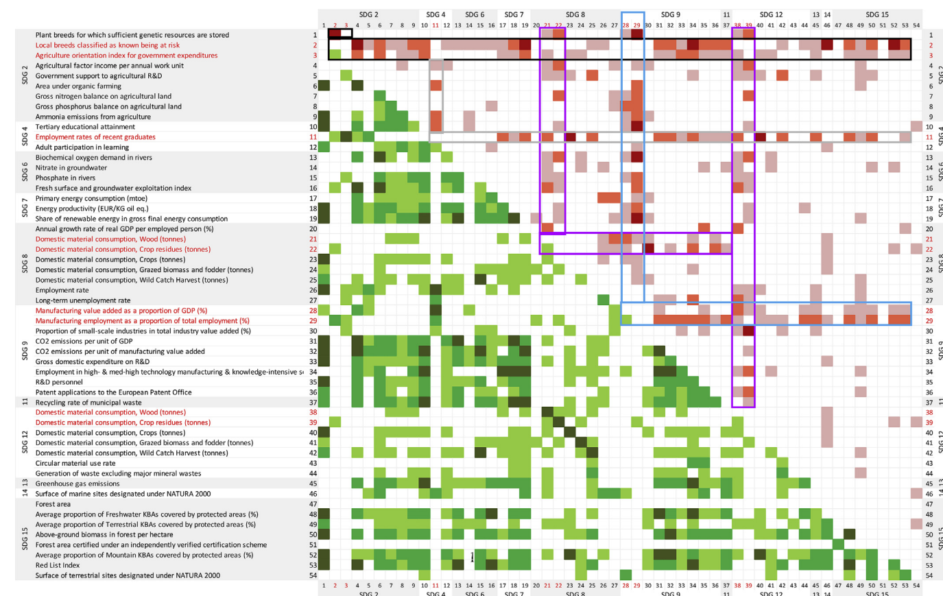
Fig. 2. Hotspots of synergies and trade-offs by pairs of bioeconomy-related SDG indicators

Note: To synthesise results on a single matrix, synergies between pairs of indicators are represented below the main diagonal and trade-offs above the main diagonal. Only cells where more than 50% of the pairwise correlations classified either as significant synergies (green) or trade-offs (red) and based on at least 60 data pairs are coloured. As a reminder, no causality inference can be made on this matrix, and accordingly, results have to be interpreted for the indicator pair (i and j) irrespective of whether indicator i is positioned in a row or in a column. (For interpretation of the references to colour in this figure legend, the reader is referred to the Web version of this article.)