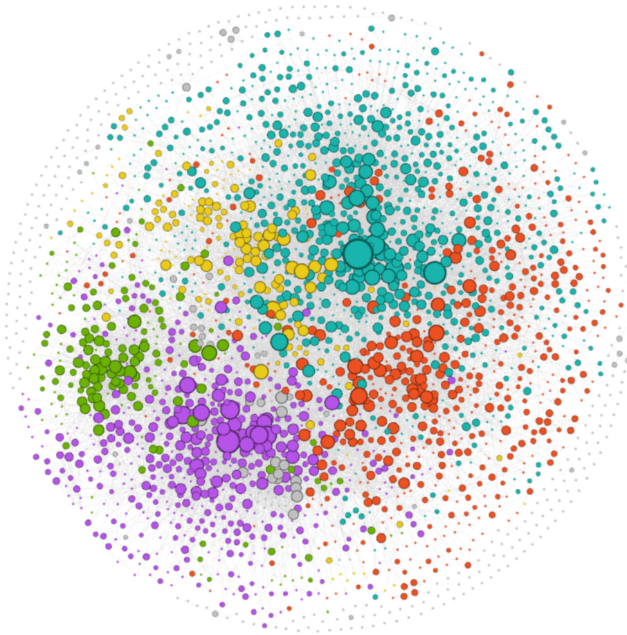
Fig. 2. The author citation network and its highly-populated intra-network communities of authors, which are visualized in light blue (Community A), purple (Community B), red (Community C), green (Community D), and yellow (Community E). The diameter of the nodes is directly proportional to their degree of centrality (weighted in-degree).

between African research institutes and North American universities is evident.