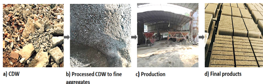
Fig. 1. Workflow of masonry brick production from processed C&DW in China (Jin et al., 2017).

The questionnaire was specifically designed to investigate perceptions of the UK construction sector's key stakeholders of C&DW on two main issues: i) the bottlenecks in C&DW management and,