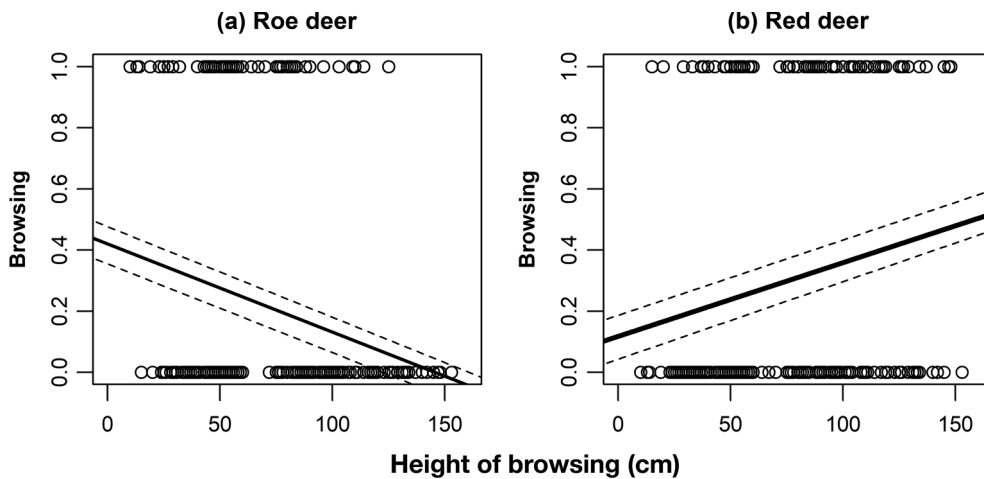
Fig. 2. Probability that a particular browsing event is attributable to (a) roe deer and (b) red deer with increasing height at which the browsing occurred on trees, as determined by amplification of eDNA left behind on the browsed twigs. Red deer were significantly more likely to be responsible for browsing at higher heights than roe deer.

significant difference in the success of amplification of deer eDNA between twigs collected from the two tree species ( -0.064 \pm 0.262 , z = -0.25 , p = 0.807 ) nor the success of amplification of twigs collected from different heights ( -0.051 \pm 0.120 , z = -0.43 , p = 0.671 ).