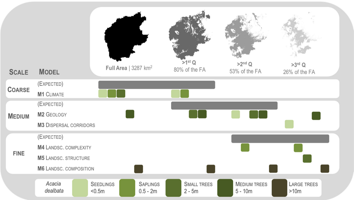
Fig. 3. Scales of spatial structure/influence (coarse-, medium-, and fine-scale) and associated models (M 1 -M 6 ; competing models representing environmental factors) selected by multimodel inference for each A. dealbata height class (Seedlings, Saplings, Small trees, Medium trees, and Large trees) for each nested area/extent (full area, area above the first quartile, area above the second quartile, and area above the third quartile). Horizontal grey bars represent the expected patterns based on the research hypothesis and on previous research.

In this test with Acacia dealbata , we used detailed field data on population height structure and calibrated an independent model for each of the several height classes (a proxy for population dynamics, life-stages and age of adult trees). We found evidence to support our hypothesis that the distribution of different height classes is influenced by distinct factors (see Table 1). Also, the spatial projections of the different models for the different height classes (see Fig. 2) provide an overview of population structure and dynamics in different stages of invasions, while maintaining a relatively straightforward modelling technique that is widely used in biodiversity and invasion research. By building models for the different height or age classes, our approach avoids the problem of using only presence-absence data for adult