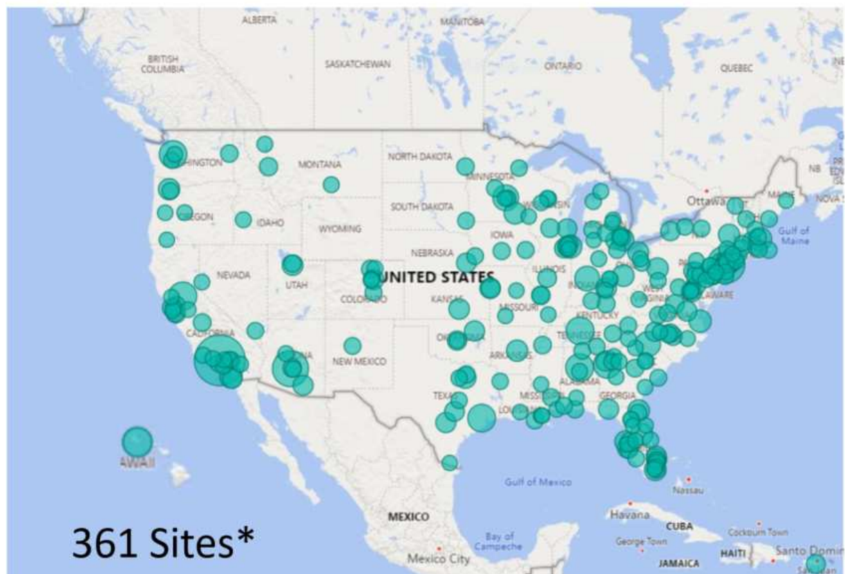
Figure 2. Number of STS/ACC TVT Registry Sites Performing Transcatheter MV Repair with the Edge-to-Edge Clip Device

Defining minimum operator and institutional requirements for these therapies is an important first step to ensuring their optimal implementation. Several of the MDT and proceduralist competencies listed in Table 3 parallel those included in the “2018 AATS/ACC/SCAI/STS Expert Consensus Systems of Care Document: Operator and Institutional Recommendations and Requirements for Transcatheter Aortic Valve Replacement” (2), although many are specific to MV intervention.