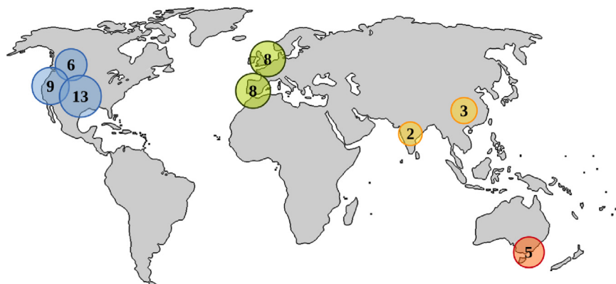
Fig. 2. Regional distribution of the case studies considered in wind power ramp-related works (see text for details).