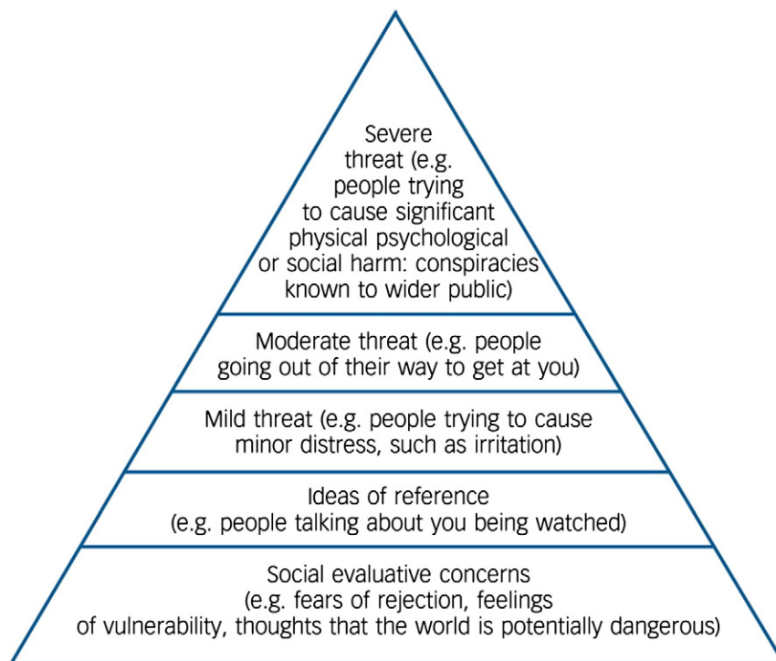
Fig. 1. The paranoia hierarchy (Freeman et al., 2005).

Tiernan et al., 2014). There is also longitudinal and experimental support. In a study of 301 patients with psychosis assessed three times over 12 months, negative cognitions about the self predicted the persistence of persecutory delusions, with little evidence of reverse causation (Fowler et al., 2012). A study of sixty patients with persecutory delusions showed that negative beliefs about the self predicted the persistence of paranoia over the next six months (Vorontsova et al., 2013). In an experimental study using virtual reality it was shown that increasing negative views of the self leads to an increase in paranoia in vulnerable individuals (Freeman et al., 2014a). There are numerous other reports of links between negative self-concepts and paranoia (Bentall et al., 2009; Hutton et al., 2013; Lincoln et al., 2013; Atherton et al., in press). Adverse experiences and environments will have a major contribution to the development of negative self-concepts (e.g. Selten and Cantor-Graae, 2005; Gracie et al., 2007; Bentall et al., 2012).