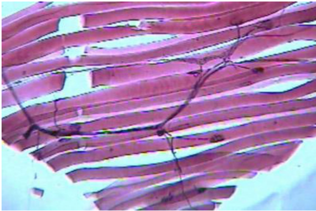
Fig. 1. Muscle innervation. An illustration of a normal motor unit showing axons leading to motor end plates (neuromuscular junctions) on muscle cells. (Taken from http://www.biology.iastate.edu/Courses/212L/New%20Site/31%20Muscle%20&%20Skeletal%20systems/muscle%20skeletal%20index.htm ). Photos and layout by Linda Westgate, Warren Dolphin, and Mark A. Mangum.

cell body loss. At 80 days, 60% of ventral root axons were lost but there was no loss of motoneurons. Motoneuron loss was well underway by 100 days. Microglial and astrocytic activation around motoneurons was not identified until after the onset of distal axon degeneration. Thus, in this animal model of human ALS, motoneuron pathology begins at the distal axon and proceeds in a “dying back” pattern. This is supported by the denervation and reinnervation changes in muscle but normal-appearing distal motoneurons following autopsy of a reported ALS patient (Fischer et al., 2004).