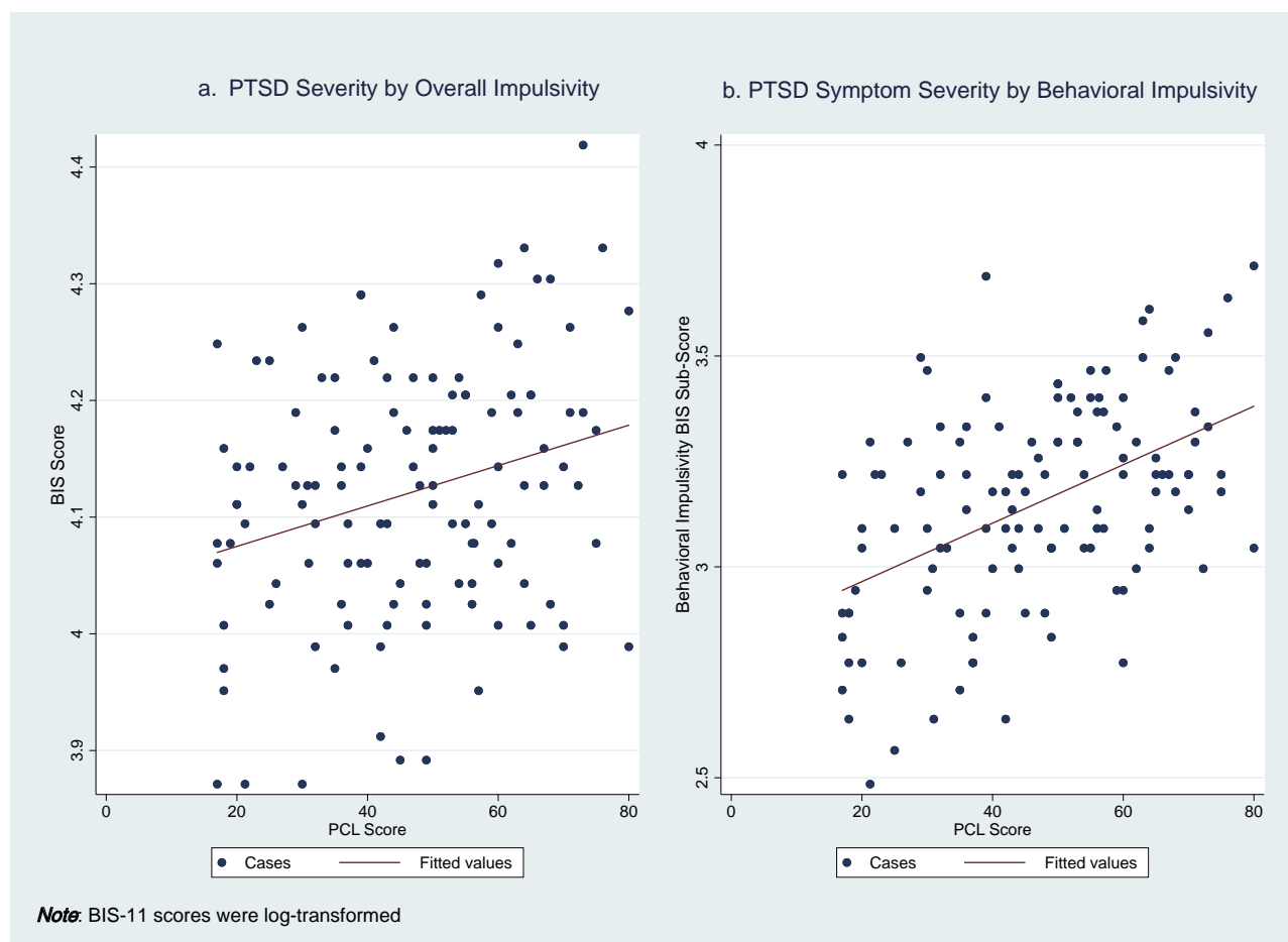
Fig. 1. Relationship between PTSD and Impulsivity.