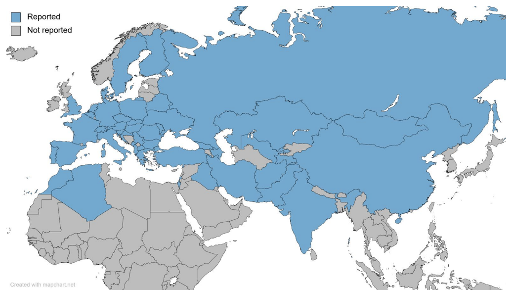
Fig. 1 Map of Culex modestus distribution (as of August 2023). Countries highlighted in blue represent those with at least one report of Cx. modestus , whereas those in grey indicate that Cx. modestus are absent or have not yet been reported. Sources used in the creation of this map can be found in the supplementary material (Additional file 2: Table S1). Created with Mapchart.net

cytochrome oxidase 1 gene (COX1) [4, 5]. Lineage I has been found in Spain and Portugal, lineage II was found in Germany, Sweden, and the UK, and both lineages were found in Belgium, France, Serbia, and Denmark. A haplotype analysis suggested that Cx. modestus from the UK and Germany share a common origin from France, whilst another part of the UK population may have been derived from Serbia [5]. In Belgium, Cx. modestus were likely derived from the UK and Germany, possibly the result of several independent introduction events [4]. Phylogeny on the basis of rRNA intergenic spacers between the 28S rRNA gene (3' end) and 18S rRNA gene (5' end) on chromosome I revealed that Cx. modestus is highly evolutionarily distant from Cx. pipiens pipiens , Cx. pipiens molestus , and Cx. torrentium [6].