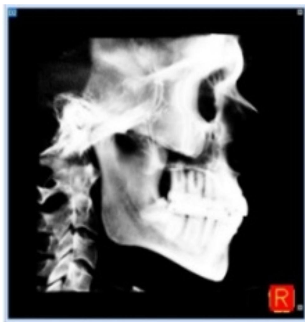
Fig. 1 A CBCT synthesized lateral cephalograms

women and 4 men ( 28^\circ \leq \text{SN-GoGn} \leq 39^\circ and 59\% \leq \text{facial height index} \leq 63\% ) and hypodivergent group including 10 women and 5 men ( \text{SN-GoGn} < 28^\circ and \text{facial height index} \geq 63\% ).