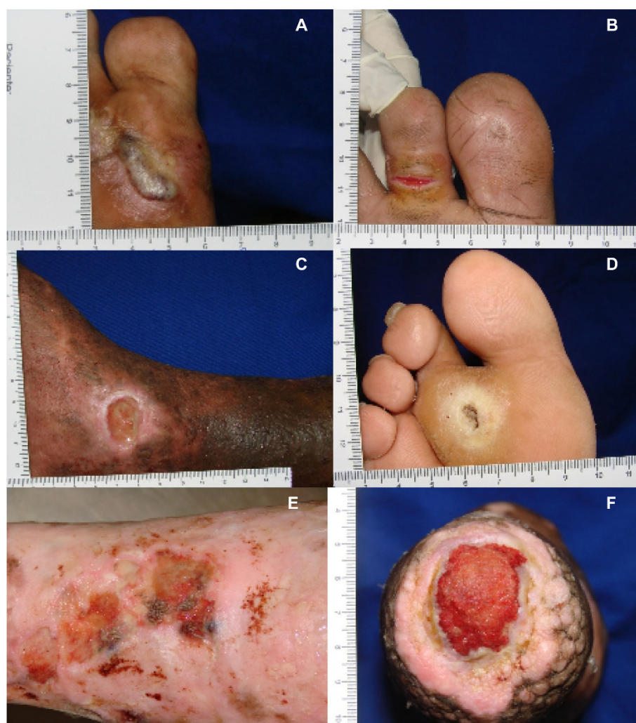
Figure 2 Examples of ulcers in patients with leprosy. (A) Blister formed after walking long distances that later became an ulcer. (B) Fissure on the base of the second toe of the right foot. (C) Right medial malleolus ulcer from a patient with leprosy and HBP. (D) Plantar ulcer on the region of second metatarsal head. (E) Myiasis in a chronic leg ulcer. (F) Chronic ulcer on a lower limb stump.

In the present study, patient ulcers were predominantly chronic wounds, which could have interfered with LLLT success. Fibroblasts in chronic wounds have impaired responsiveness to growth hormone, which may be due to an increased number of senescent cells [12]. It was observed in neuropathic diabetic foot ulcers that wound duration negatively affected the chance of