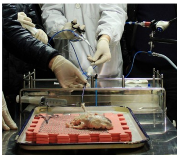
Fig. 1 Isolated porcine kidney and ureter

All results were expressed as mean \pm SE. The data was analyzed for statistical significance by using t -test, chi-square, and Mann–Whitney U test (SPSS 15.0 software). The differences were considered significant at P < 0.05 .