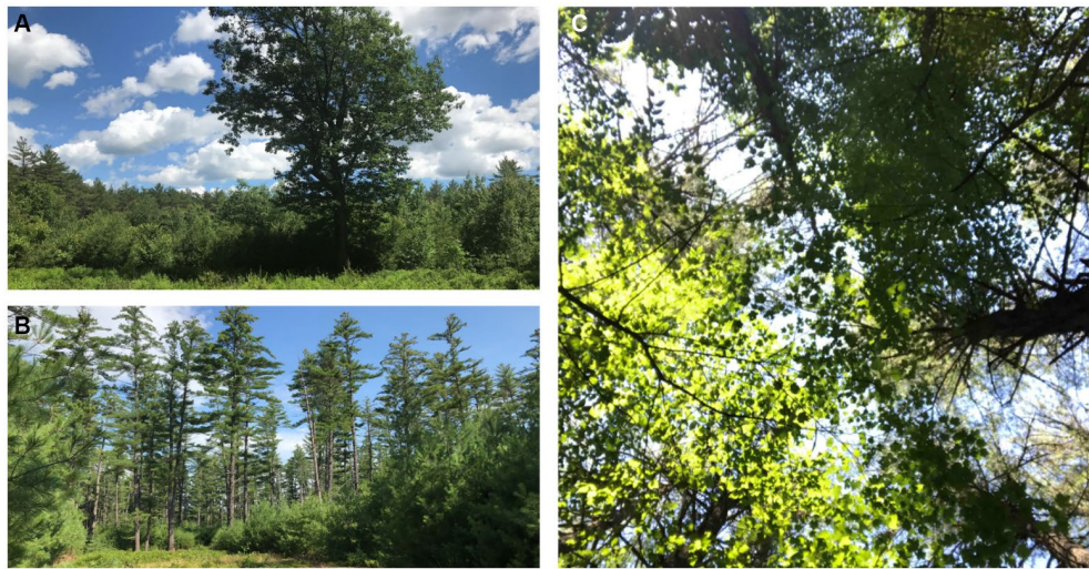
FIGURE 1 Silvicultural treatments: (A) top left patch cut (1.2 ha opening) at the Massabesic Experimental Forest in Lyman, Maine, (B) bottom left shelterwood, and (C) shaded overstory conditions in an untreated control in Bear Brook State Park, Allentown, New Hampshire.

White pine is also commercially valuable for timber products and aesthetic values for recreational purposes, providing billions of dollars in revenue to local economies (Costanza et al., 2018). However, it is susceptible to a variety of pathogen and insect pests which include, but are not limited to, white pine weevil ( Pissodes strobi ), white pine blister rust (WPBR, Cronartium ribicola ), Caliciopsis canker ( Caliciopsis pinea ), and foliar diseases such as needle casts and brown spot needle blight ( Lecanosticta acicola ) (Costanza et al., 2018). White pine weevil is a native insect pest to North America, where it damages Picea and Pinus species by killing the terminal leader, resulting in multi-stemmed growth form and serious lumber defects (Major et al., 2009; Ostry et al., 2010). Vigorously growing trees in full sunlight are more susceptible to damage compared to trees growing in partial shade because weevils attack succulent shoots with thicker bark produced in open conditions (Hamid et al., 1995). In addition, more open