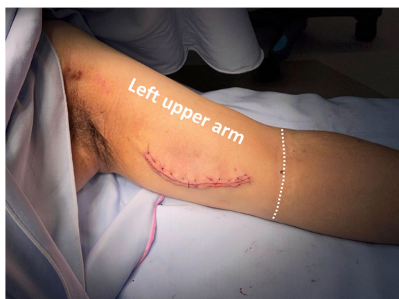
Fig. 2 Incision for brachial vein transposition-arteriovenous fistula creation on the left upper arm. The dotted line indicates the cubital fossa

block, return of sensation in the axilla and the left lateral side of the thoracic wall was confirmed by pinprick, while sensory loss in the other areas and motor block persisted. Approximately 18.5 h after completion of the nerve blocks, the patient started feeling pain at the incision site.