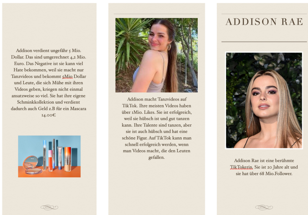
Figure 3. Brochure (Addison Rae, TikTok).