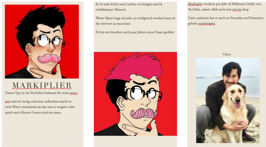
Figure 2. Brochure (Markiplier, YouTuber).

ics also varied from football, pop music, and humour to lifestyle. Two examples of the brochures that the students prepared can be seen in Figures 2 and 3. The majority of the male students chose males and the female students chose females to present as their famous influencers (and celebrities). There was only one exception to this trend in the classroom, a black girl who presented a black male singer in her assignment. Students related to the influencers that they presented concerning multi-layered aspects of their identities including age,