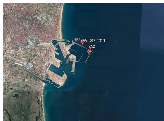
Figure1: Port of Valencia's future expansion project with the potential location of three wind power generators A1, A2 & A3.

Based on a recent assessment report for the implementation of wind energy generators at the port of Valencia, the estimated resource was around 5.5 m/s, which is in line with the estimations from [6,7], by using the corresponding extrapolation. There are several options for the deployment in terms of total installed power Figure 2 . The annual estimated power (AEP) would be in the region of 37 GWh. This energy would cover around of 50% of the energy needs of the port of Valencia, according to could be covered.