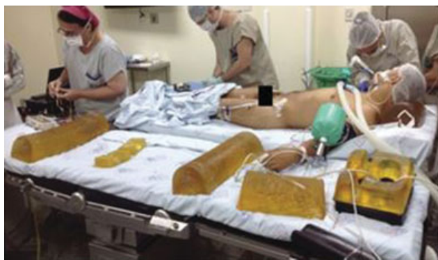
Fig. 1 Patient intubated on a side stretcher at the surgical table. Appropriate cushions are positioned to avoid decubitus ulcers after the patient is positioned in ventral decubitus.

aspiration pneumonia; However, with the development of new anesthetic techniques and new drugs, the risks were reduced. 34