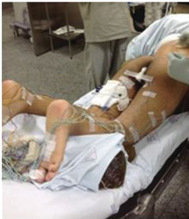
Fig. 3 Patient in ventral decubitus with electrodes positioned on the lower limbs and in the perichannel region.