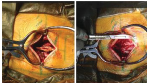
Fig. 5 Left: dorsal musculature distanced with visualization of the supraspinatus ligament and spinous process of L1. Right: after laminotomy, exposure of the dural sac to the level of the medullary cone.

From this moment, saline solutions should be avoided because they alter the responses of the EMG. The edges of the dura mater are anchored with Vicryl or nylon 4.0 to keep the channel open. The first foramen of the anterior and posterior roots, lateral to the MC, is sought. The root is found, it is divided into four parts to initiate the stimulation to pulses of 0.1 thousandth of a second to a frequency of 0.5 Hz and then 50 Hz, and then identify if we are stimulating motor or sensory fibers. In spasticity, sensory fibers are hyperactive;