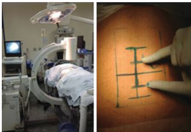
Fig. 4 Left: patient positioned in ventral decubitus at the moment radioscapy is performed to find the level of the spine that will be approached. Right: marking on the skin with the size of the incision.

exposure of the interlaminar space, the yellow ligament is removed with visualization of the dural sac. A linear incision is made to expose the medulla and visualize the MC and the cauda equina.