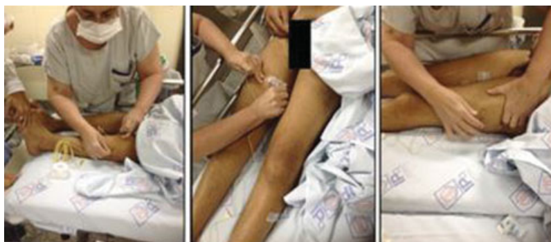
Fig. 2 Positioning of the EMG electrodes in the muscles of the lower limbs.

After making a horizontal incision, with the opening of the subcutaneous cell tissue, we dissected the dorsal musculature away from the thorny process until the slides of the L1 vertebra were exposed, in this example (► Fig. 5 ). After