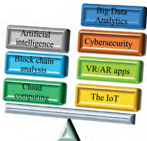
Figure 2: A Graphical representation on implications of GDPR on emerging technologies

Figure 2 displays a graphical representation of the Implications of GDPR on emerging technologies. The following areas may be discussed below as follows.