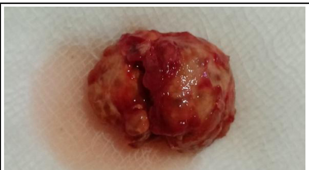
Figure 3. Tumour after complete resection.

Intra-operatively, a volar oblique incision was made on the right thumb under local anesthesia. The dissection was then carried into the subcutaneous tissue. A large mass measuring 3x2x0.5 cm grey-brown in color was completely removed (Figure 3).