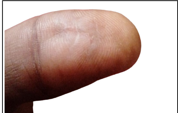
Figure 4. Post-operative image of the thumb at 7 months of GCTTS excision.

follow-up at 6 weeks and 6 months. However, he continues to do well at 7 months post-surgery with no complaints and no signs of recurrence (Figure 4).