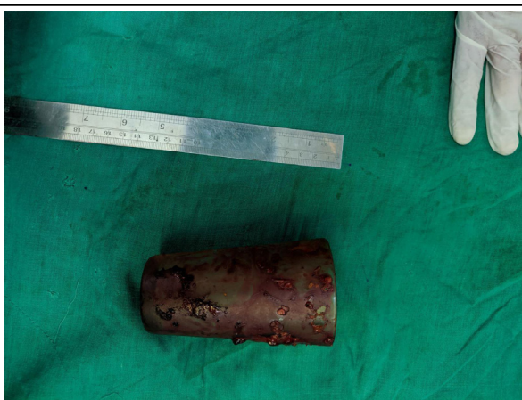
Figure 3. Post-operative specimen of the removed glass.

Primary repair of sigmoid enterotomy was done and a pelvic drain was kept. The post-operative period was uneventful. On the third postoperative day, the patient passed flatus and a liquid diet was started. The patient had passed stool passed by the fifth postoperative day. A drain was removed on the sixth postoperative day and the patient was discharged on the seventh postoperative day. On regular follow-up, after two months of the surgery he is well, and the anal tone is still intact.