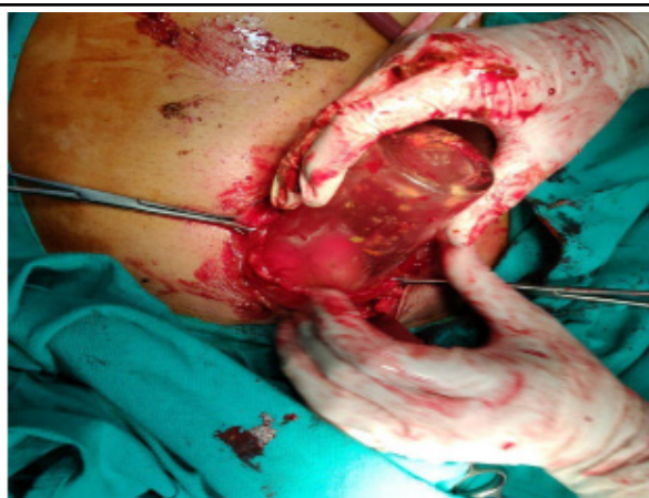
Figure 2. Sigmoid enterotomy to remove the glass.

Exploratory laparotomy was performed through a lower midline incision. No evidence of bowel perforation was noted. The water glass could be felt in the sigmoid. Milking was attempted to deliver the glass through the anus, but this was unsuccessful as the glass was high up, inverted and tightly wedged. Hence sigmoid enterotomy was done and the glass was extracted (Figure 2 and Figure 3).