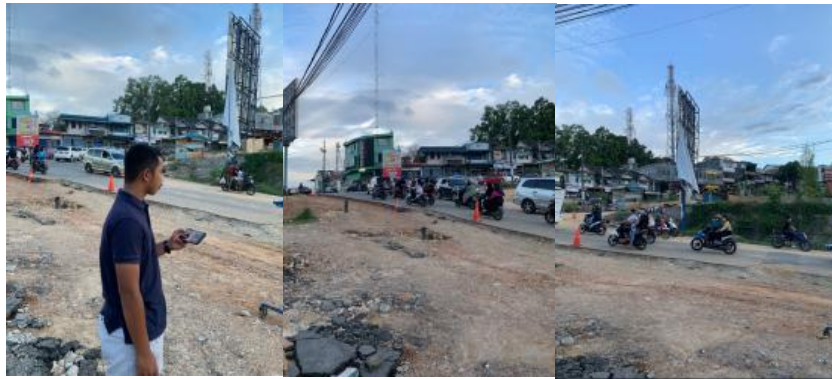
Figure 2. The survey activity

The value of the degree of saturation is theoretically between 0 to 1. This means that if the value is close to 1, the road conditions are close to saturation. Meanwhile, if the degree of saturation is far from the value of 1, then the road condition is not saturated. The analysis carried out in this study is to calculate the volume of traffic flow in Bengkong. So from this analysis, the degree of saturation (DS) will be obtained.