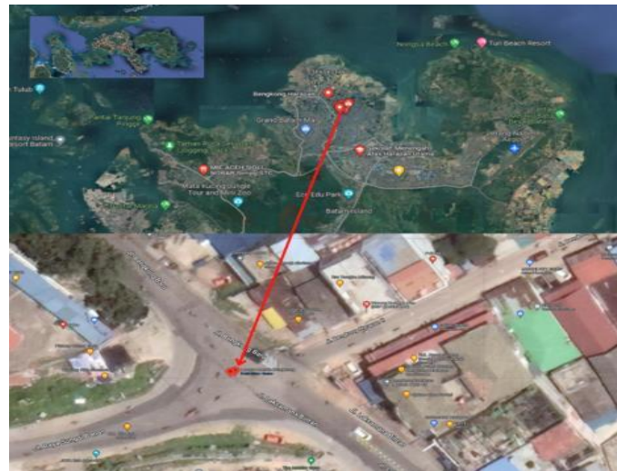
Figure 1. The research location