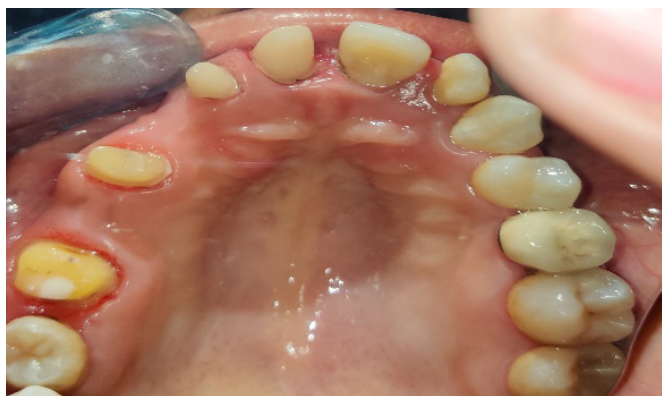
Fig. 2. Tooth preparation