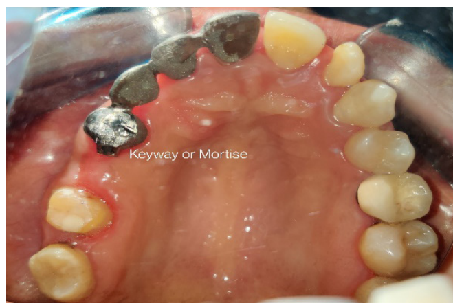
Fig. 4. Try in of Anterior metal assembly with keyway on distal of 14.

the master cast was then mounted on an articulator. Wax patterns were fabricated for 11, 12, 13, and 14 first. A plastic castable female attachment (Mortise) was waxed upon the distal surface of the wax pattern. The parallelism of plastic male attachment was determined through surveying. Investing and casting were completed. In the patient's mouth, a metal try-in of the anterior attachment with keyway or mortise was done, and a pickup impression was made with elastomeric impression material (Fig. 4,5). The Key was seated in the casted keyway, and wax patterns for 15 and 16 were made connecting the key into the keyway. Casting procedures were carried out in the similar manner.