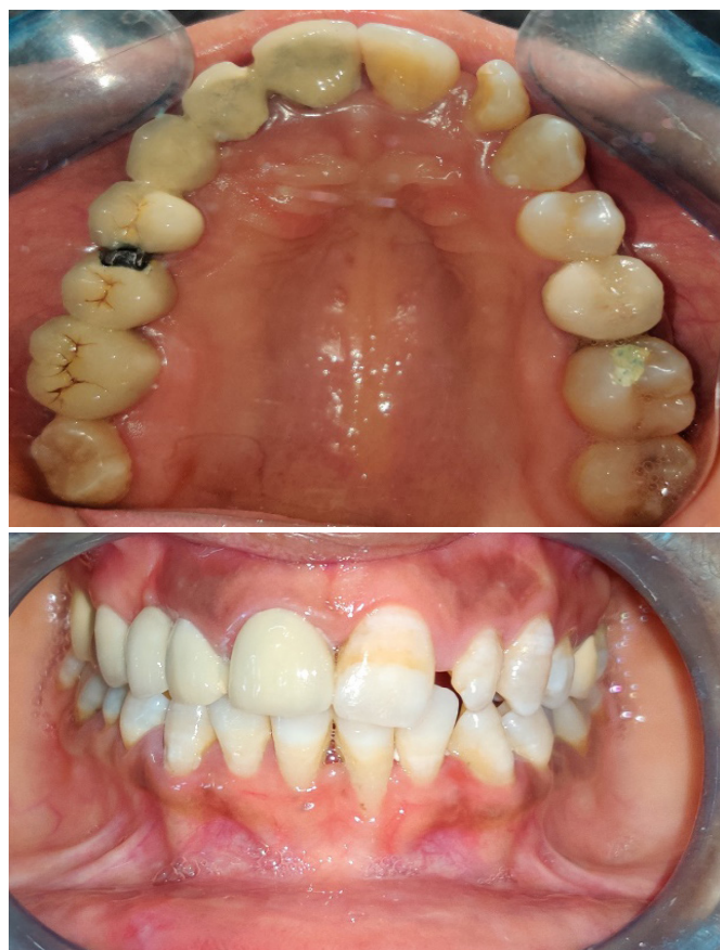
Fig. 7. FDP with non-rigid connector- In situ

Gold Label 1, GC INDIA) was used for the cementation. An articulating paper was used to check the occlusion after removing the extra cement.