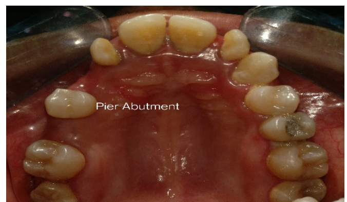
Fig. 1. Intraoral photograph with missing 13, 15, and 14 as pier abutment.

After obtaining written consent from the patient, maxillary right central incisor (11), lateral incisor (12), first premolar (14), and first molar (16) were prepared to receive PFM crowns with shoulder finish lines and equigingival margins (Fig. 2). The gingival retraction cord was used, and the final impression was made with elastomeric impression material utilizing a two-stage putty wash technique and poured into die stone to obtain the master cast. Bite registration material (Occlufast Rock, Zhermack SpA, Italy) was used to make an interocclusal record. Provisional restorations were made from a tooth-colored auto polymerizing acrylic resin (UNIFAST™ Trad, GC Corporation, Japan) and cemented with non-eugenol temporary cement (NETC, Meta Biomed, Inc., USA) (Fig. 3). Using an interocclusal record,