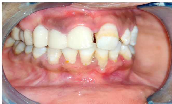
Fig. 3. Provisional crowns- In situ