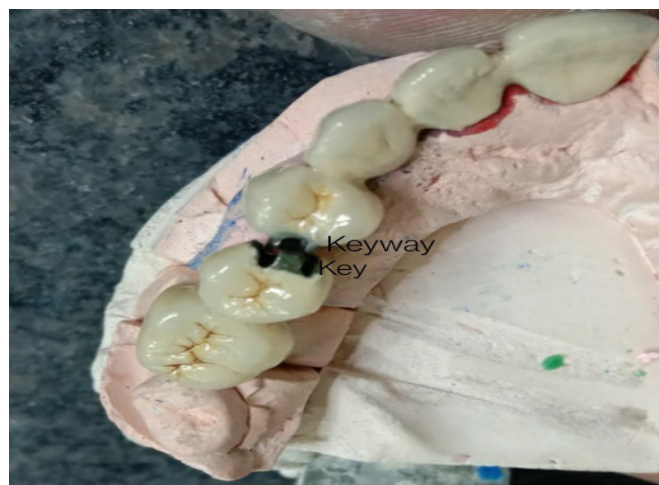
Fig. 6. Completed FDP with non-rigid (Tenon-mortise) connector between 14 and 15.