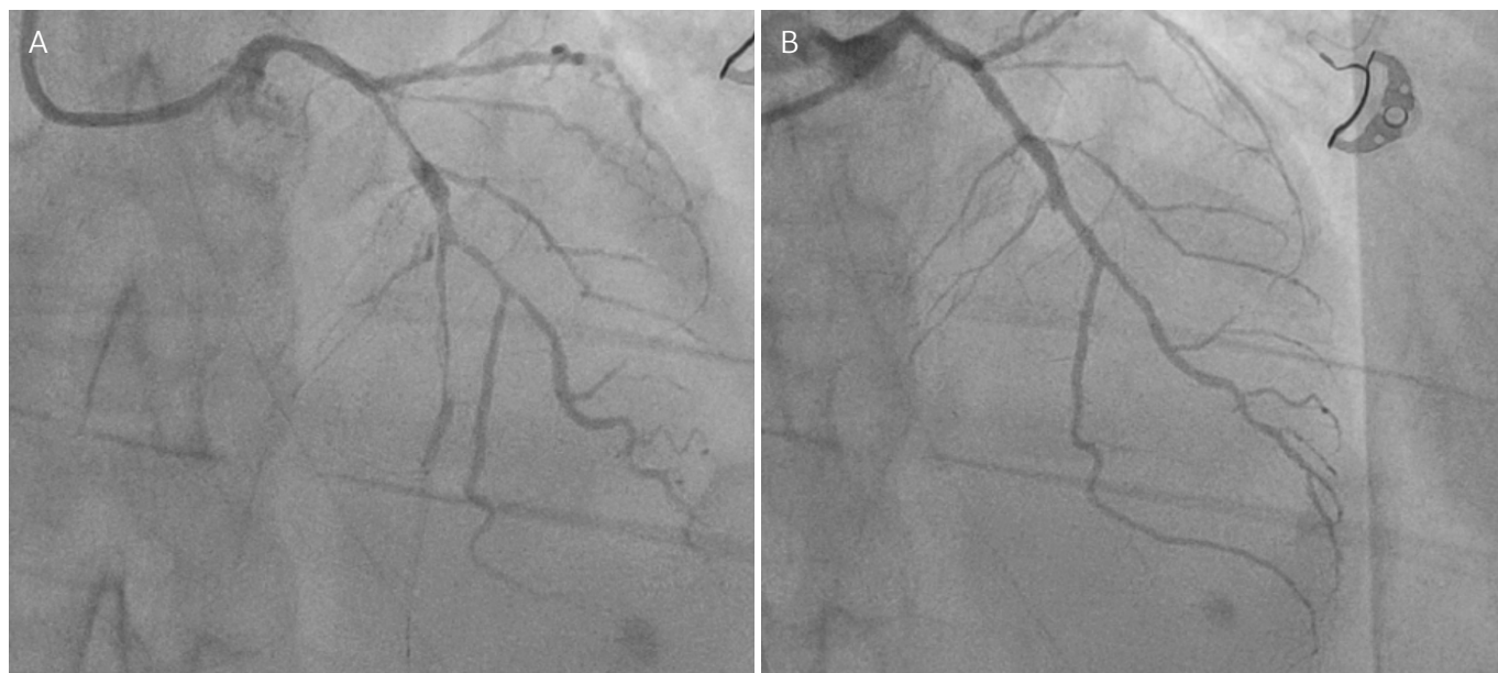
FIGURE 2. Interventional aspects. A – Pre-interventional aspect of LAD; B – Post-interventional aspect of LAD after stenting

A 54-year-old hypertensive, actually ex-smoker but habitual smoker, dyslipidemic woman was hospitalized two times in a month in our clinic. At the first presentation, the patient was admitted with cardiogenic shock due to multiple episodes of successfully resuscitated ventricular fibrillation, preceded by angina. The onset of anginal