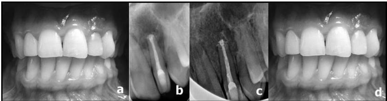
Figure 3 (a) Photograph shows that discoloration of tooth, (b) 6 months follow up with radiographically, (c) 1 year follow up with radiographically, (d) photograph of after bleaching and aesthetic restoration

symptoms. At 6-month recall, the tooth exhibited mobility within physiologic limits and no evidence of periodontal pockets and was functioning normally. Unfortunately, gray discoloration was detected on the tooth (Figure 3a). Radiographic examination revealed repair of the lesion (Figure 3b). 12 months follow-up radiographs revealed resolution of periapical radiolucency, trabecular bone formation, and closure of the root apex with a totally asymptomatic tooth (Figure 3c). Because of discoloration, internal bleaching was planned. The 35% hydrogen peroxide ( \text{H}_2\text{O}_2 ) was placed into the pulp chamber. (Opalescence®Endo; Ultradent Products Inc., South Jordan, UT, USA). The access cavity was sealed using Cavit. After four days the cavt was removed, the \text{H}_2\text{O}_2 was irrigated with distilled water, and a fresh \text{H}_2\text{O}_2 was placed into the access cavity. Next appointment tooth color was satisfactory so that bleaching was stopped. \text{Ca}(\text{OH})_2 was placed access cavity for antioxidizing effect and the cavity sealed temporarily. After a week tooth was restored using composite resin (Figure 3d).