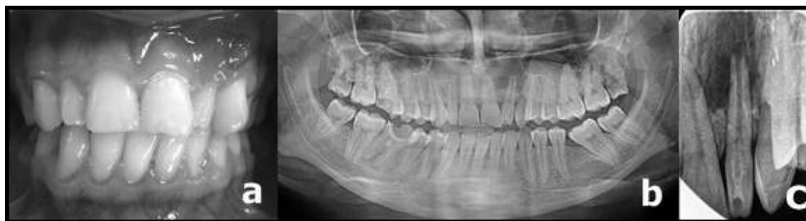
Figure 1 (a) Photograph shows that maxillary left incisor has a sinus tract, (b) panoramic radiograph shows that the contralateral tooth did not reveal malformation, (c) periapical radiography shows that a dens invagination and periradicular lesion

A 21-year-old female patient applied to, Ordu University, Faculty of Dentistry owing to discontent with the esthetic view of her maxillary lateral tooth. Clinically, both of right (#12) and left lateral incisors (#22) showed an abnormal coronal shape, with smaller mesiodistal diameter. 12 was showed tenderness when exposed to the cold test and electric pulp test but 22 wasn't positive for sensitivity. Moreover, there was a sinus tract in the periapical side around the 22 and the patient was asymptomatic (Figure 1a). Upon radiographic examination, the anomalous was detected the internal structure of 22 that was consistent with Oehlers' Type II dens invaginatus but the malformation didn't show on 12 (Figure 1b). A large radiolucent lesion around the apex of the 22 along with wide-open apical end was detected by intraoral periapical radiograph (Figure 1c). Because of the periradicular lesion was associated with the main canal, a diagnosis of pulpal necrosis with asymptomatic apical periodontitis was made. Nonsurgical endodontic treatment and apexification were planned.