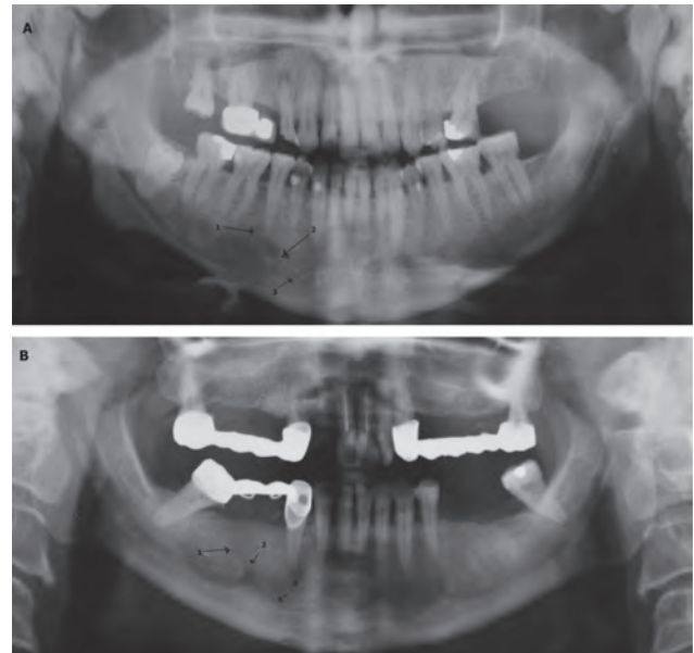
Figure 1. Panoramic radiographs of two patients 35 (Fig 1A) and 58 (Fig 1B) years old respectively, showing the mental foramen (arrow No1), the endosteal canal of the anterior loop of the inferior alveolar neurovascular bundle (arrow No2) and the mandibular incisive canal (arrow No3)

remains within the incisive bony canal and forms a nerve plexus that innervates the pulpal tissues of the mandibular first premolar, canine and incisors via the dental branches 1 .