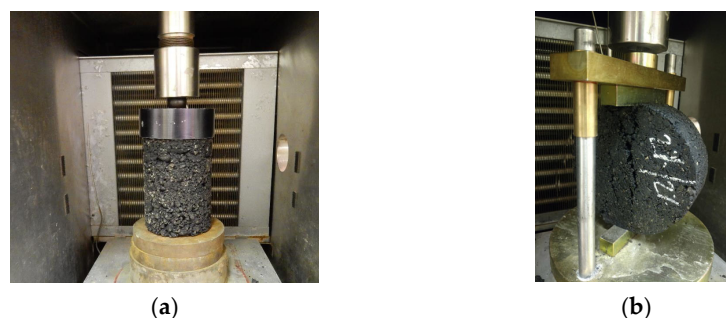
Figure 2. Specimen setup for (a) compression test and (b) indirect tension test.

The strength of the Proctor specimens was measured following ASTM D1633 [5] but at a displacement rate of 50 mm/min. The indirect tensile strength (IDT) of the SGC specimens was measured according to ASTM D6931 [6]. All testing was conducted at 77 °F (25 °C). The test assembly for both types of tests is presented in Figure 2.