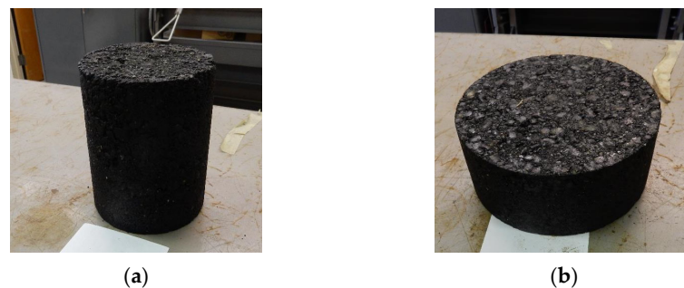
Figure 1. Compacted 100% RAP emulsified cold mix specimens: (a) Proctor and (b) SGC.

Compacted specimens were prepared two ways: (1) based on AASHTO T 180 Method C, and (2) using a Superpave gyratory compactor (SGC). Specimens were then cured at 104 °F (40 °C) for 72 h. Typical examples of compacted specimens are presented in Figure 1.