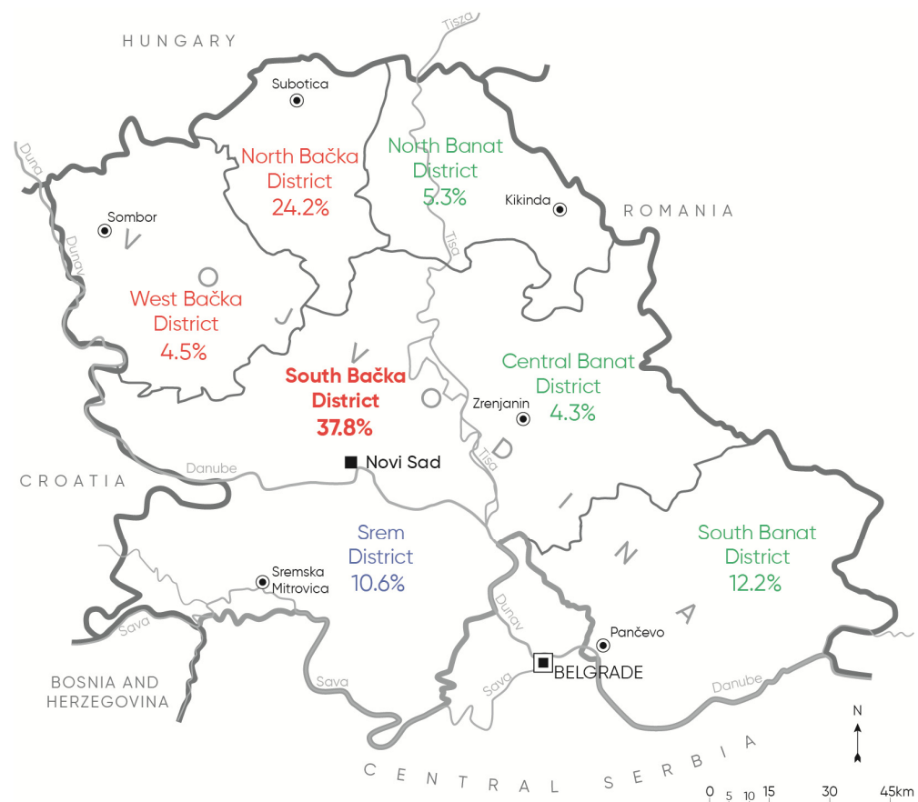
Figure 2. The area with the largest potential for attracting tourists motivated by gastronomical heritage (Author: Đerčan, 2023).