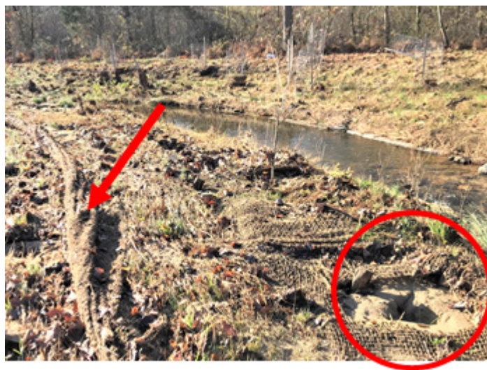
Figure 2. Floodplain erosion and fabric tear (arrow) and “potholes” (encircled) created by uprooted plant saplings following a large storm on a recently restored site. Toppled wire meshes used for planted saplings can also be seen in the background on the opposite floodplain. The photo is facing downstream, and the direction of the overbank flows is indicated by the toppled grass in the downstream direction.