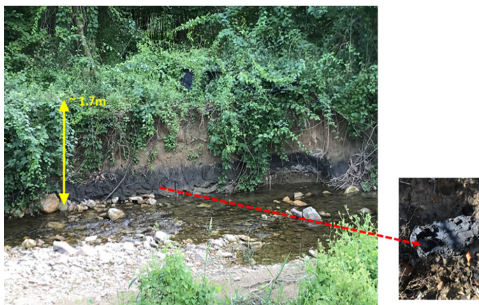
Figure 3. Buried organic horizon along Gramies Run in Cecil County, Maryland, that was carbon-dated to 950 \pm 30 BP [12]. These precolonial organic horizons buried under light-colored legacy sediments are especially common in the Mid-Atlantic United States. Currently, there are no specific guidelines on how these historic hydric soils should be preserved and retained in stream and floodplain restorations, and this void typically results in a loss of these horizons during restorations.

Floodplain construction practices probably have the greatest impacts on surface and subsurface soil microbiomes and their functions. Low porosity and high bulk density soils will provide a poor environment for microbes involved in nutrient cycling and removal [37,66], which can be further aggravated by a lack of organic matter in the soils [67]. Buried soils, including the relict hydric soils (Figure 3), have typically been reported to have lower metabolic microbial activity compared to organic horizons at the surface [52]. Thus, when these buried streambank soils are exposed at the floodplain surface, a new soil microbiome regime is likely established. This change could be even more dramatic and likely detrimental for nutrient processing, if foreign soils with a completely different microbiome community are introduced at the site.