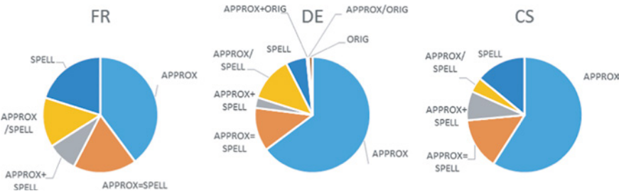
FIGURE 2 Relative weight of the adaptation principles in the sample. Total numbers of lexical units analysed: FR: N = 382; DE: N = 690; CS: N = 518

The data confirm the prominence of phonological approximation (APPROX). As we see in the charts, phonological approximation is clearly the most common principle in all three languages, accounting for more than a third of the entries in French and for almost two thirds in German and Czech (40%, 65% and 59%, respectively). Hypothesis 2 is therefore confirmed. Figure 2 shows