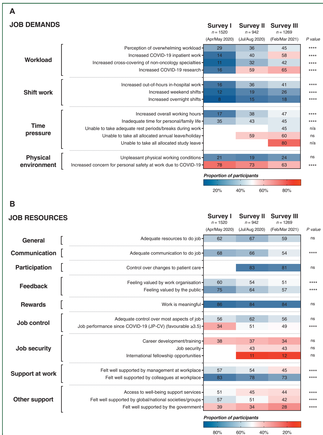
Figure 3. Heatmaps of factors which may be contributing to worsening distress and feeling burnout since COVID-19.