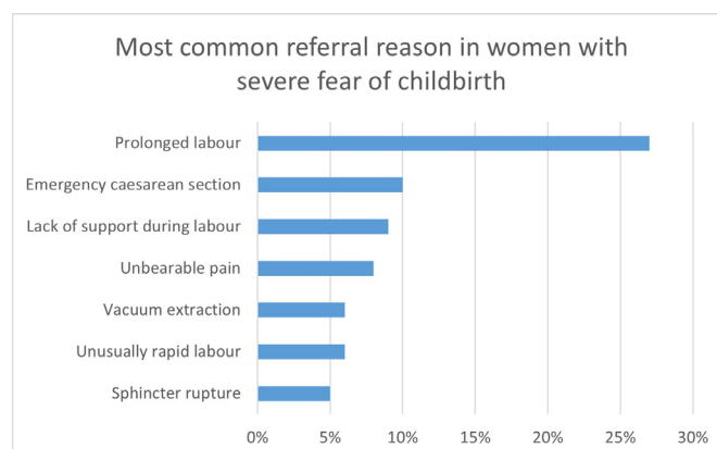
Figure 1 Referral reasons for severe fear of childbirth.

The answers from the interviews were categorised into three themes: lack of involvement; lack of communication and information; and lack of care plan. The women