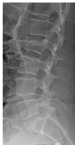
Fig. 2 Incomplete compression fracture (AO Spine Type A3) of L2 after fall from a horse

Falling from a horse was significantly related to spinal or pelvic injuries. Regarding spinal injuries previous studies reported more lumbar and thoracic than cervical spine injuries with a predominance of the thoracolumbar junction [6, 21] (Fig. 2). The average hospital admittance time (25 days) for spinal and pelvic injuries in our study