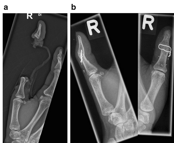
Fig. 3 a Subtotal amputation of the thumb after entanglement with reins. b Salvage of the thumb with arthrodesis of the distal joint

Each author certifies that he or she, or a member of their immediate family, has no commercial associations (e.g., consultancies, stock ownership, equity interest, patent/licensing arrangements, etc.) that might pose a conflict of interest in connection with the submitted article.