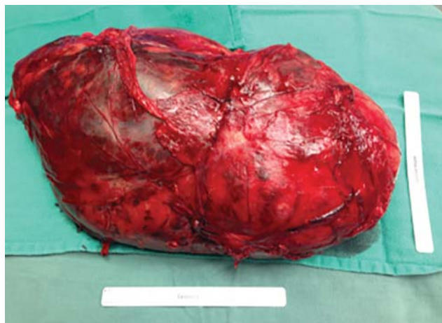
Figure 2 Gross specimen of left adrenal myelolipoma measuring 34 \times 20 \times 13 cm.

However, due to concern for malignancy, such as liposarcoma, and symptoms from mass effect, the patient underwent bilateral resection of the retroperitoneal masses. Intraoperatively, adrenal glands were not visualized. Pathologic examination revealed fat interspersed with myeloid tissue and a diagnosis of bilateral myelolipomas was made. The left tumor was 34 \times 20 \times 13 cm and weighed 4.7 kg (Fig. 2). The right tumor measured 20 cm in maximal dimension and was removed in three separate fragments. Adrenal tissue was present in the both tumors (Fig. 3).