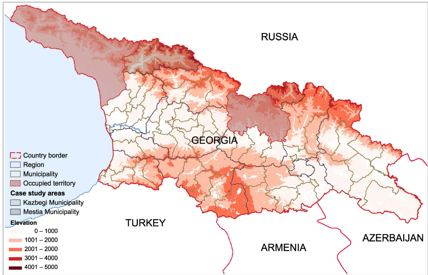
FIGURE 2 Mountainous study sites in the Greater Caucasus. (Map by Temur Gugushvili)

their studies of these massive amounts of unstructured social data available online.