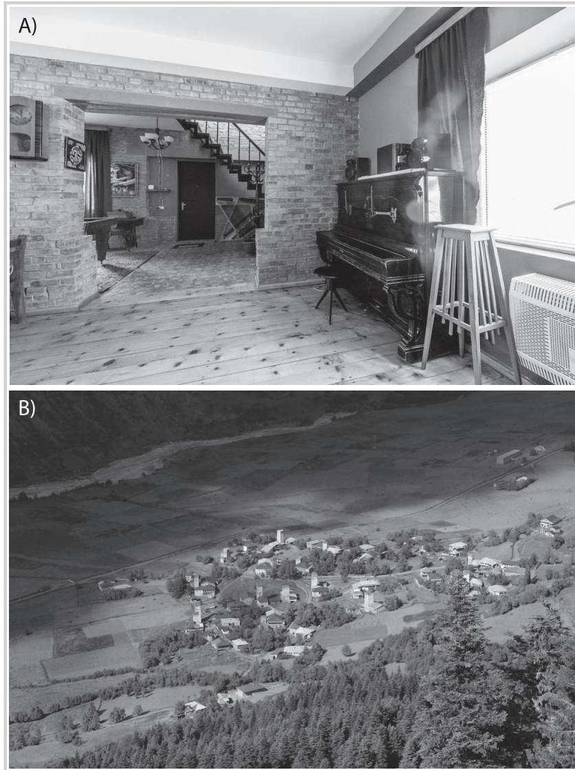
FIGURE 3 (A) Interior of the Guesthouse in Stepantsiminda, Kazbegi; (B) landscape of the Mestia municipality

products). The core product is the most basic level that the consumer is really seeking to buy. The actual product is the good/service offered to the consumer with specific characteristics, a design, a brand name, and packaging. Importantly, this study focused on the augmented product, which represents the additional benefits (friendliness, helpfulness, general atmosphere, and image) that a consumer receives in obtaining the product (McGrath 1999; Salamoura and Angelis 2008).