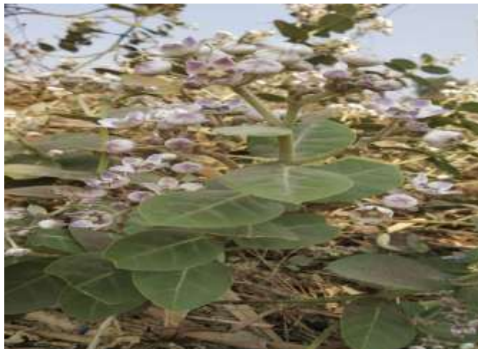
Figure 1: Calotropis Gigantea Linn Plant

Calotropis gigantea Linn (Apocynaceae) is a glabrous or snow-white, laticiferous shrubs or small trees, about 3-4 m tall generally known as the swallow-wort or milkweed Fig. 1 and is used as one of the most important drug in Traditional System of Medicine to treat various ailments. Scientific classification of Calotropis gigantea Linn summarized in Table 1.