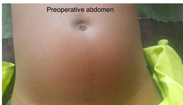
Figure 1. Preoperative abdomen.

Intra-operative findings included a hemoperitoneum of over 1000 mL, an intact gestational sac in the pouch of Douglas containing a macerated male fetus with a loop of umbilical cord round the neck. There was no obvious fetal dysmorphic or structural malformation. The placenta was attached mainly to the posterior surface of the uterus, the right fallopian tube, the right broad ligament, and a few spots on the small intestine. The uterus was examined, and there was no evidence of uteroperitoneal fistula. The left fallopian tube was normal. The placenta was completely shelled off from the attached structures. The right fallopian tube and the right broad ligament invaded by the placenta were friable; and were excised. The friability of the right fallopian tube limited a distinct evaluation for the presence or absence of any tubo-peritoneal fistula. Hemostatic sutures were applied over the posterior wall of the uterus, and remnants of the right broad ligament were anchored over the posterior surface of the uterus to provide tamponade. Compression was sufficient to secure hemostasis over few bleeding spots on the bowel. An abdominal drain was placed. (Figure 2)