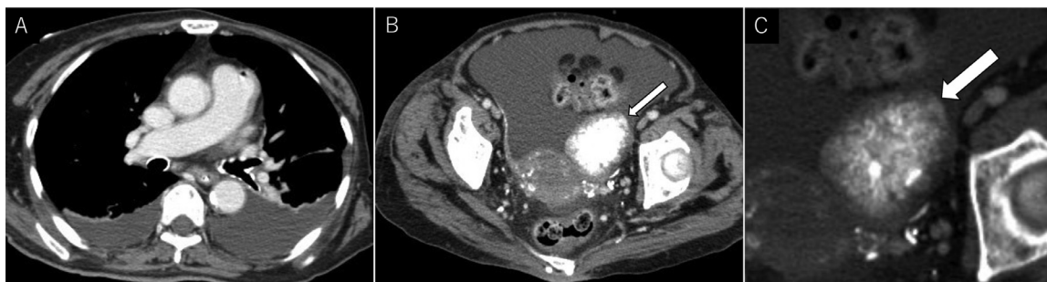
Fig. 1 – (A, B) A large amount of pleural effusion and ascites is seen, with no pleural or peritoneal thickening or nodules. (B, C) A left adnexal tumor with diffuse punctate calcification is seen (arrows).