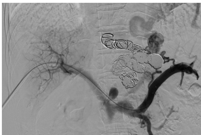
Fig. 3 – Postinterventional portal venography demonstrating a huge decrease in portosystemic shunt and normal portal vein re-flow.

an effective BRTO, PTO can be considered as a secondary treatment option for managing HE.