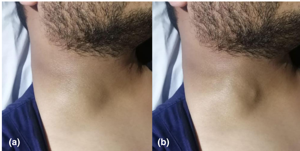
Fig. 1 – Four-centimeter right external jugular pseudoaneurysm as seen on physical exam before (a) and after Valsalva (b).