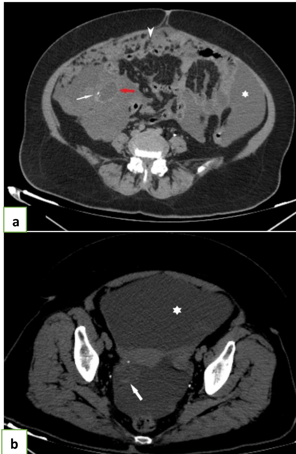
Fig. 1 – Abdominal post injection CT scan showing a cystic mass in the right lower quadrant, in contact with the caecum (red arrow) containing mural calcifications (with arrow) (A) and pelvic cystic mass (B) (large white arrow), CT also showed nodular and thickening of peritoneal reflections with stranding and thickening of the omentum (head arrow) and peritoneal effusion (Asterisk). (Color version of figure is available online.)