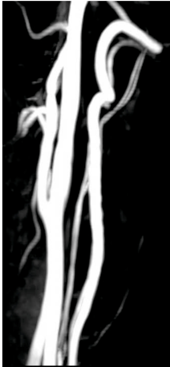
Fig. 1 – Continued

lateral OAs arising from the TCTs. The extremely hyperplastic ACAs arose from the transverse cervical arteries, not from the inferior thyroid artery, and continued to the OAs (Fig. 1). A schematic illustration of the normal anatomy and that of our patient is shown in Figure 2.