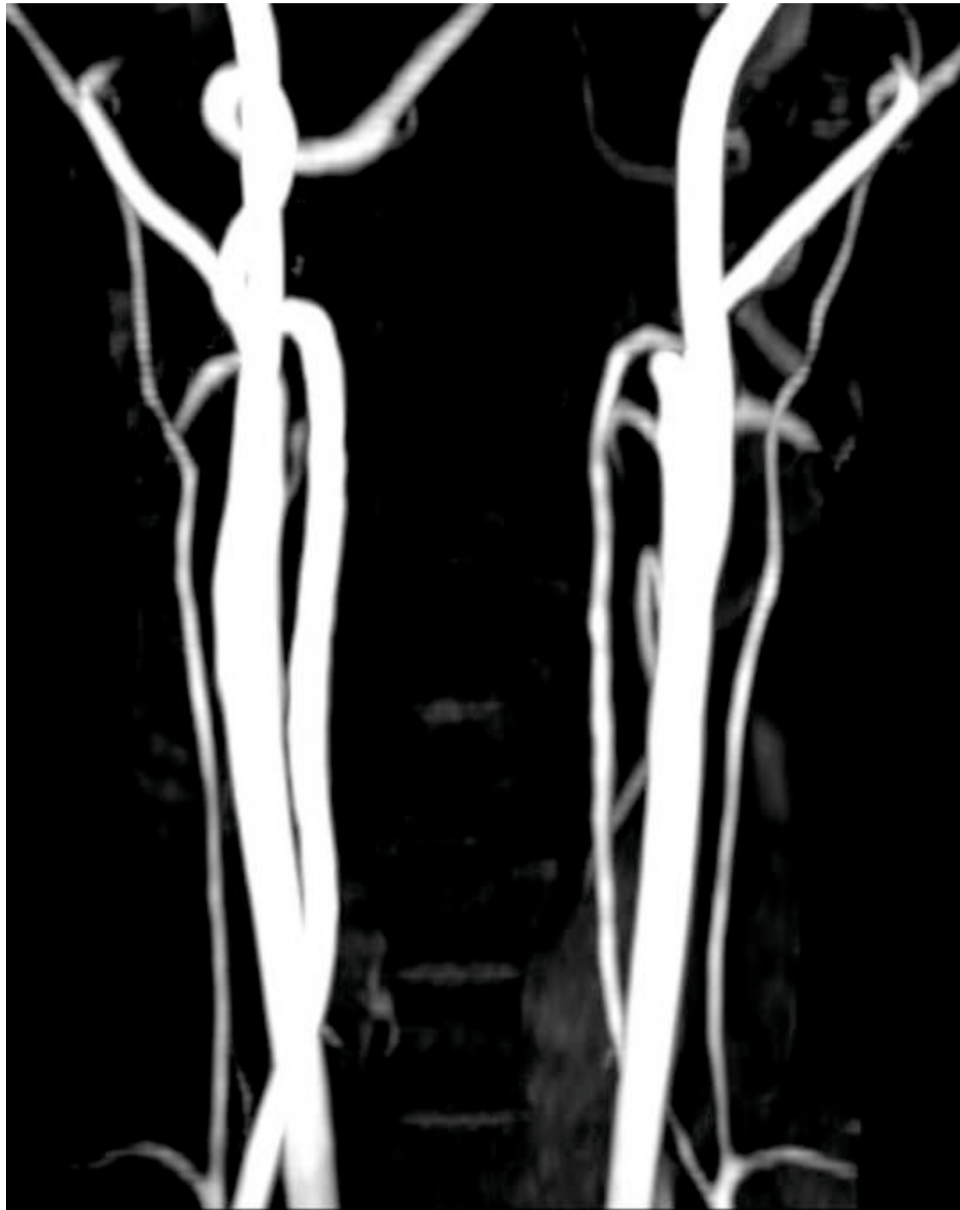
Fig. 1 – Maximum-intensity-projection images of anteroposterior (A) and left lateral (B) projections of magnetic resonance angiography of the neck show bilateral occipital arteries arising from the thyrocervical trunks. The extremely hyperplastic ascending cervical arteries arise from the proximal segment of the transverse cervical arteries, and continue to the occipital arteries, bilaterally (arrows).

bilateral OAs arising from the TCTs. This variation is regarded as bilateral ACA-OA anastomosis. Only one case of the unilateral type of this variation has been reported previously; in that case, the variation was found during dissection [8].