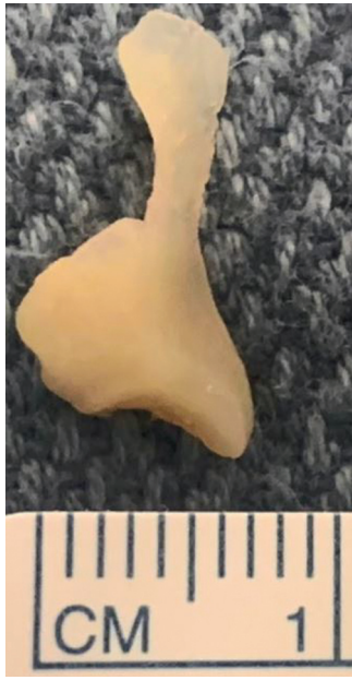
Figure 2. Foreign body specimen.

postoperatively, flexible nasopharyngoscopy demonstrated resolution of the initial findings without airway obstruction.