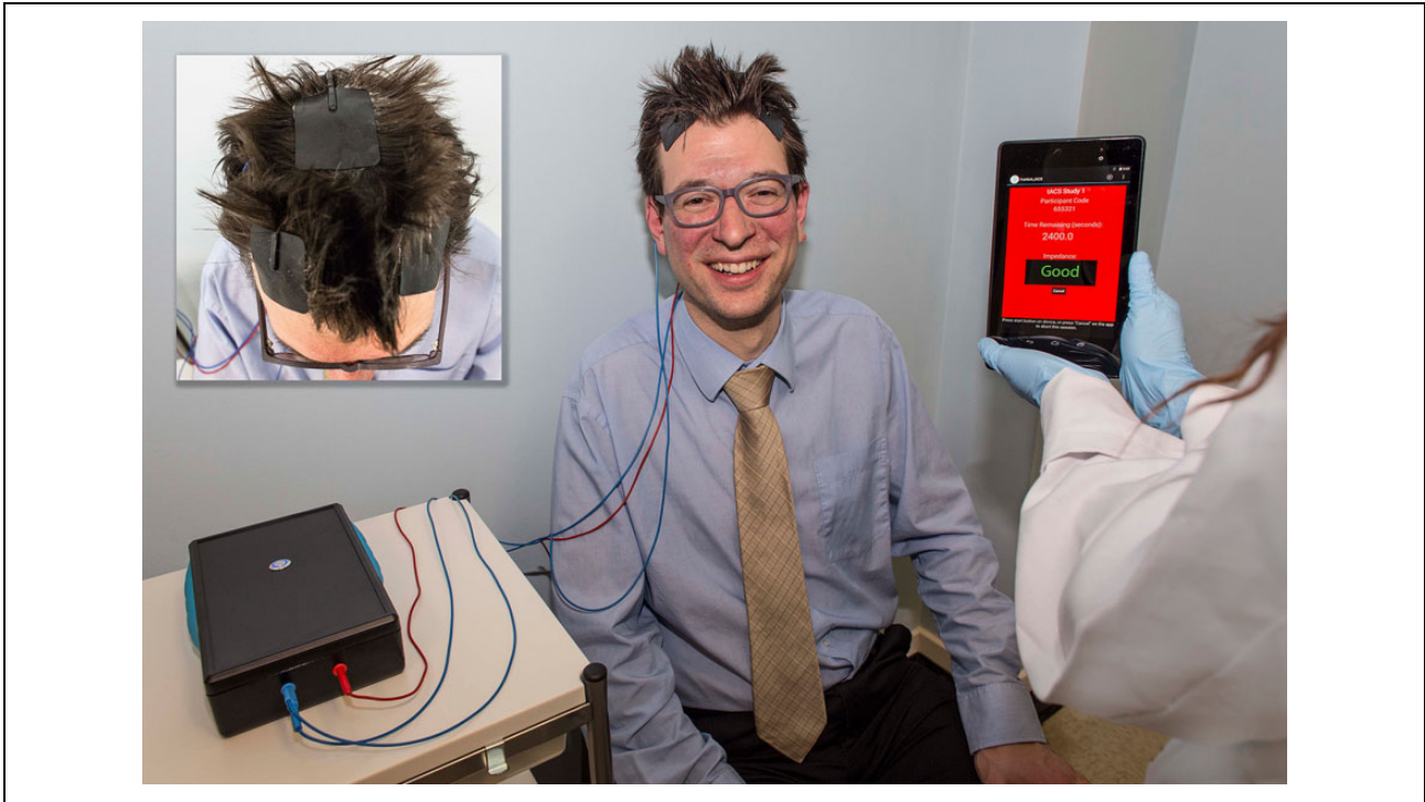
Figure 1. tACS can be applied with portable, battery-powered devices as the one shown here developed by one of the authors (FF). Stimulation current is delivered by electrically conducting silicone–carbon electrodes (inset), which are attached to the scalp with conducting paste typically used for attaching EEG electrodes. The electrodes are relatively large (typically 5 \times 5 cm) for broad spatial reach of the resulting electric field. The shown montage has been used in a number of our clinical trials in which we targeted deficits in large-scale brain functional connectivity in the alpha frequency band. tACS: transcranial alternating current stimulation; EEG: electroencephalogram.

conceptualization of pathological changes in brain rhythms still mostly relies on the visual examination of EEG traces. In stark contrast, there are neuroscience research communities that have traditionally discounted the presence of the rhythmic organization measured by EEG (or as a local field potential (LFP) from implanted electrodes in animal models) as an epiphenomenon. The recent advent of transcranial alternating current stimulation (tACS) has revitalized and partially resolved this debate about the causal role of brain rhythms. This novel form of noninvasive brain stimulation applies a weak sine-wave current to the brain via scalp electrodes (Figure 1). With tACS, there is now a safe tool at our disposal for noninvasive, targeted modulation of human brain rhythms. What makes tACS attractive is that the required hardware is lightweight and relatively cheap, thus offering the opportunity of mobile and widespread deployment of this brain stimulation technology. The obvious and exciting application of tACS in human neuroscience is to modulate a specific brain rhythm and determine changes in cognition and behavior that have been associated with this rhythm in previous EEG studies. A quickly growing number of studies have been able to demonstrate such causal links between brain oscillations and specific cognitive functions such as working memory. 4 A comprehensive review would be beyond the scope of this article. Rather, we here focus on outlining a novel approach