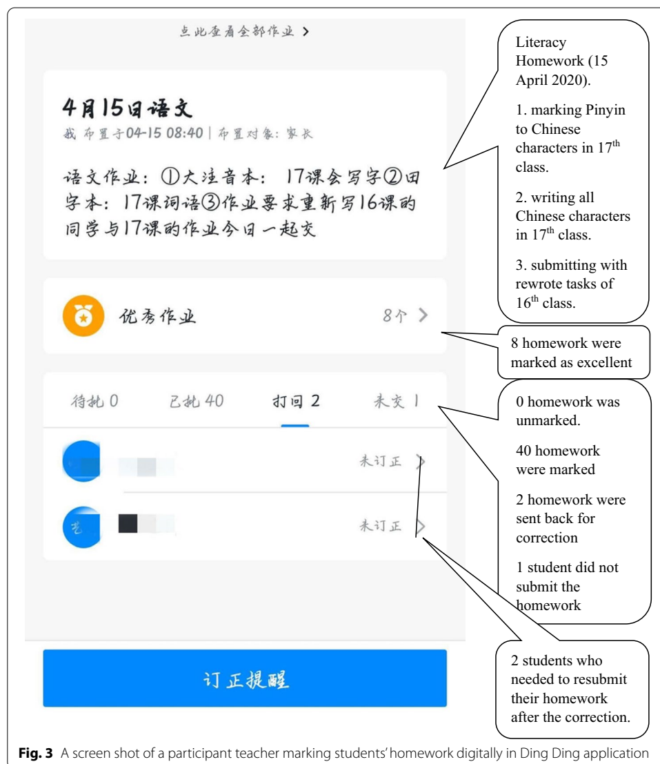
Fig. 3 A screen shot of a participant teacher marking students' homework digitally in Ding Ding application

Each teaching video was only 20–30 min. long (45 min. each physical class) based on guidelines from the Ministry of Education that the teaching videos should not be too long for primary school students in terms of protecting their eye development and reducing the risk of short sightedness (Ministry of Education of People's Republic of China, 2020a). Longer breaks (30–60 min.) between each sky class and one two-hour lunch break for a day were required by the Ministry of Education (Ministry of Education of People's Republic of China, 2020a, 2020c). These requirements on the schedule of sky classes reduced actual learning time from 4–4.7 hr. per weekday in physical schools to 0.67–2.75 hr. online.