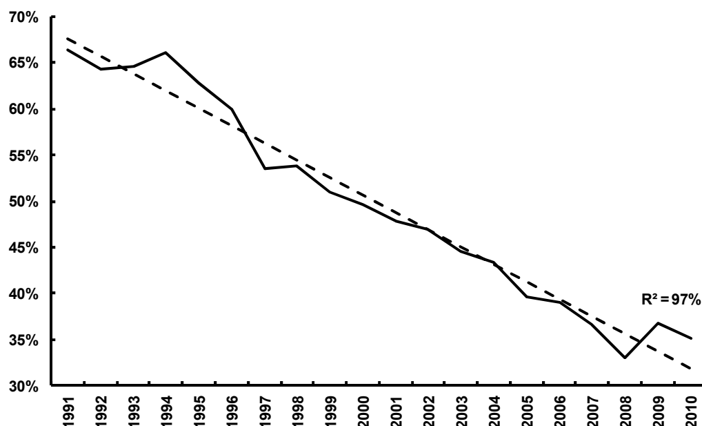
Figure 1. Historical development of the RWA/TA ratio of systemically important banks

Source: The Banker Database, Author's calculations and estimates, See Appendix 1. For a similar chart for selected individual banks, see Figure 14 in Blundell-Wignall and Atkinson (June 2011).