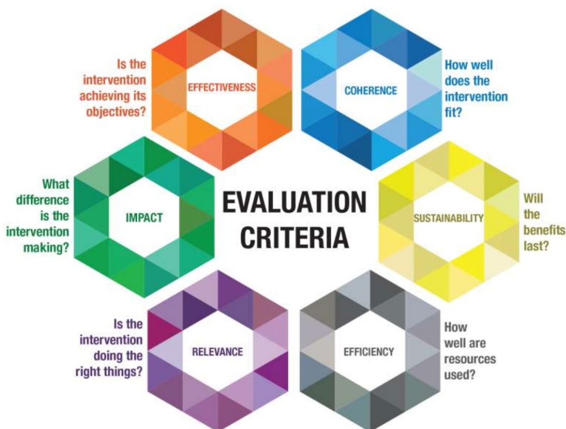
Figure 3.2. The OECD DAC evaluation criteria