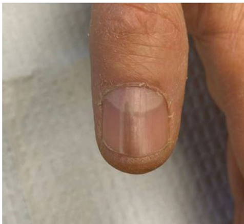
Figure 1. Right thumb. Longitudinal dark stripe beginning at the level of the distal lunula.